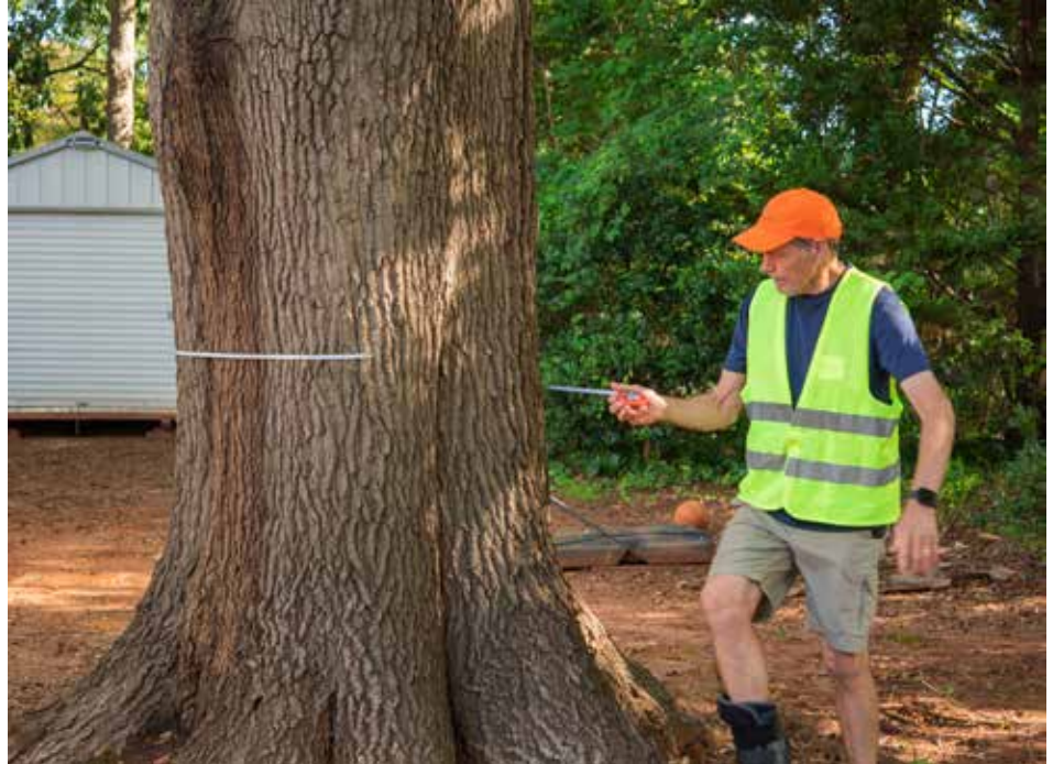
TreeMapping is an integral part of our Treesilience Initiative, where we locate, identify, and measure trees.

The list below represents private donations from individuals, family foundations and associations, including donations made as TreeGifts or as honorariums or memorials. These funds help ensure the day-to-day function of our organization and are key to achieving our success.