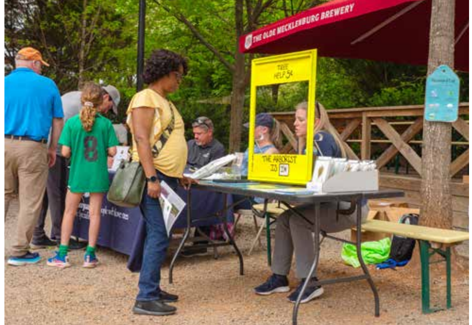
Our Second Annual TreeFest took place at Olde Mecklenburg Brewery on April 27, 2024.