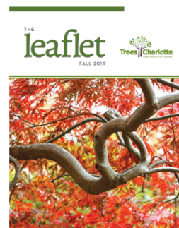
MapleWalk: An inspiring love story

As an Evergreen sponsor, you will have the opportunity to submit a full-page sponsored content piece or advertisement in each print Leaflet, which we'll also run on TreesCharlotte.org and promote in the e-Leaflet.